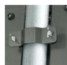
Accessory for truss / tripod mounting