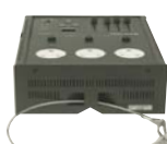
JAZZ 310 - JAZZ 311 with safety fuse